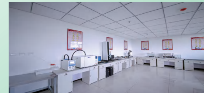
QUALITY TESTING LABORATORY